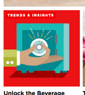
Unlock the Beverage Opportunity