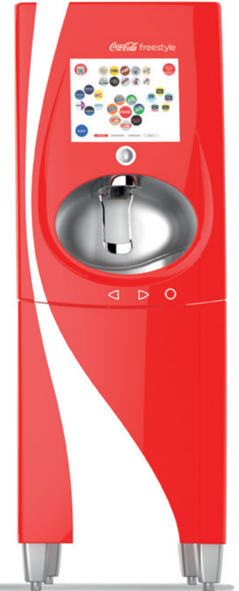
Self Serve 9000