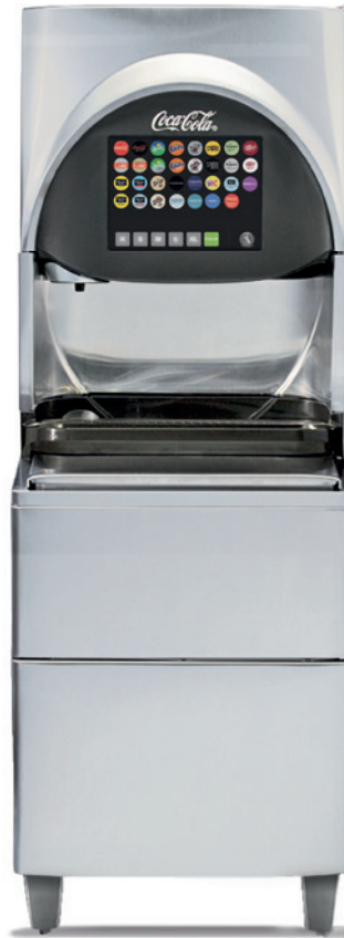
Crew Serve 8000

Streamlines labor and saves storage space