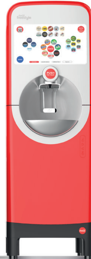
NEW Self Serve 9100