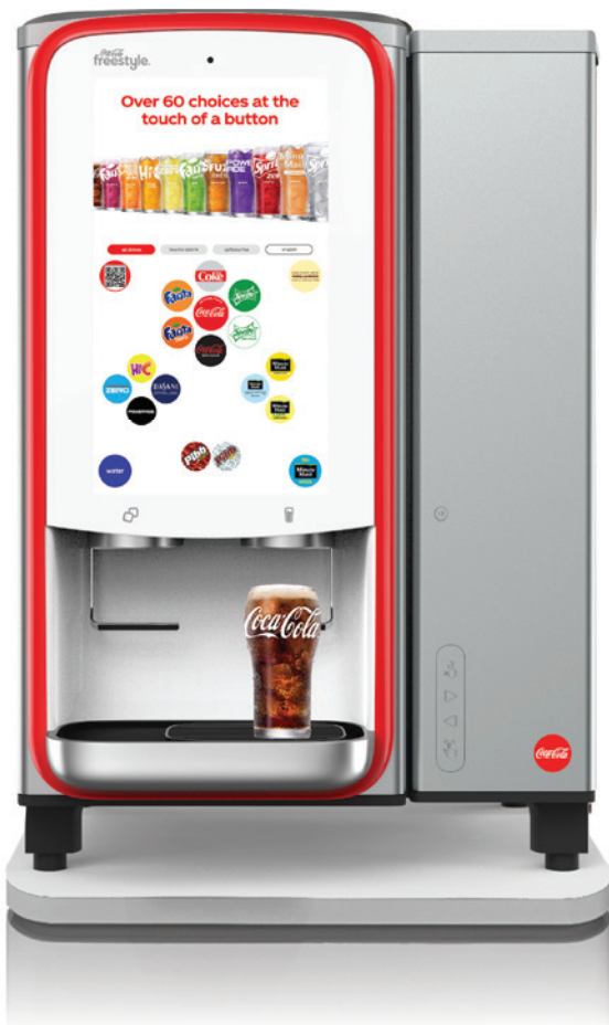
Self Serve, Countertop (7100)